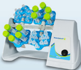
Roto-Mini™ Rotator Series