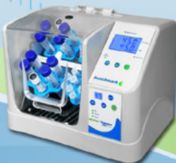
Roto-THERM™ Incubated Rotator Series